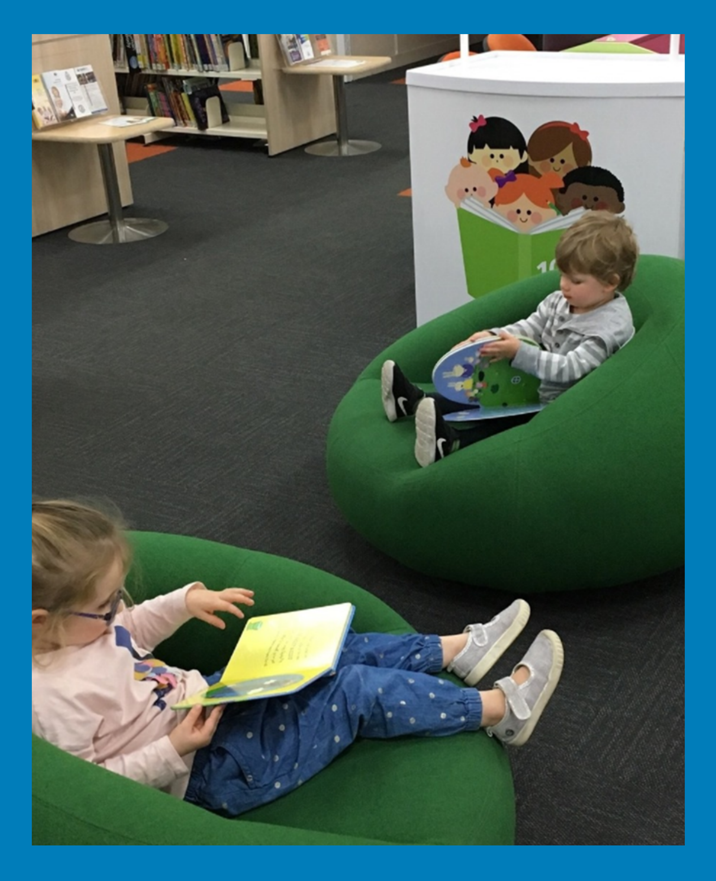
Or I can go to a special quiet area if I like.